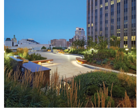
The terrace provides a public green space and breathtaking views of the Ottawa area.