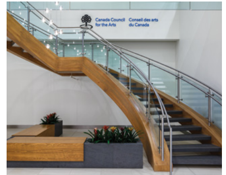
One lineal mile of reclaimed pine from the Ottawa River was used in public spaces – including all feature walls, benches, stair cases, and directional signs.